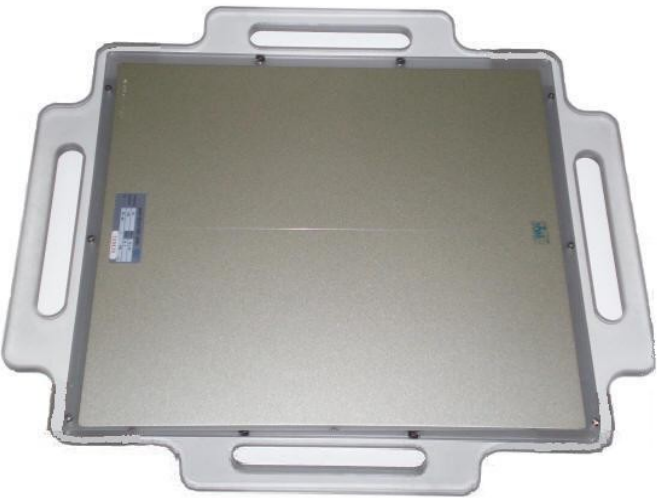
EZ GUIDE PROTECTOR